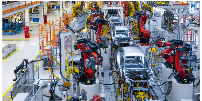
Automotive & MRO