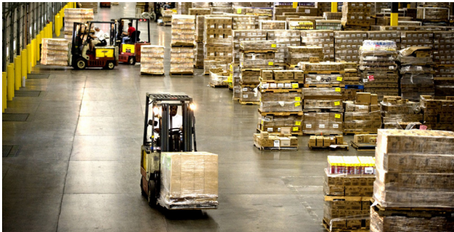
Logistics & Warehousing