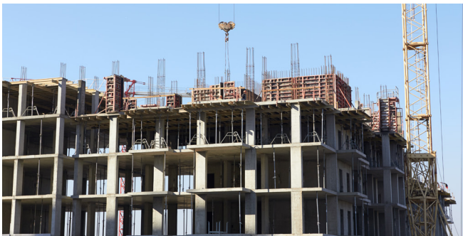
Construction & Heavy Equipment