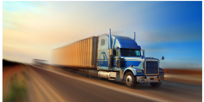
Transportation & Fleet Maintenance